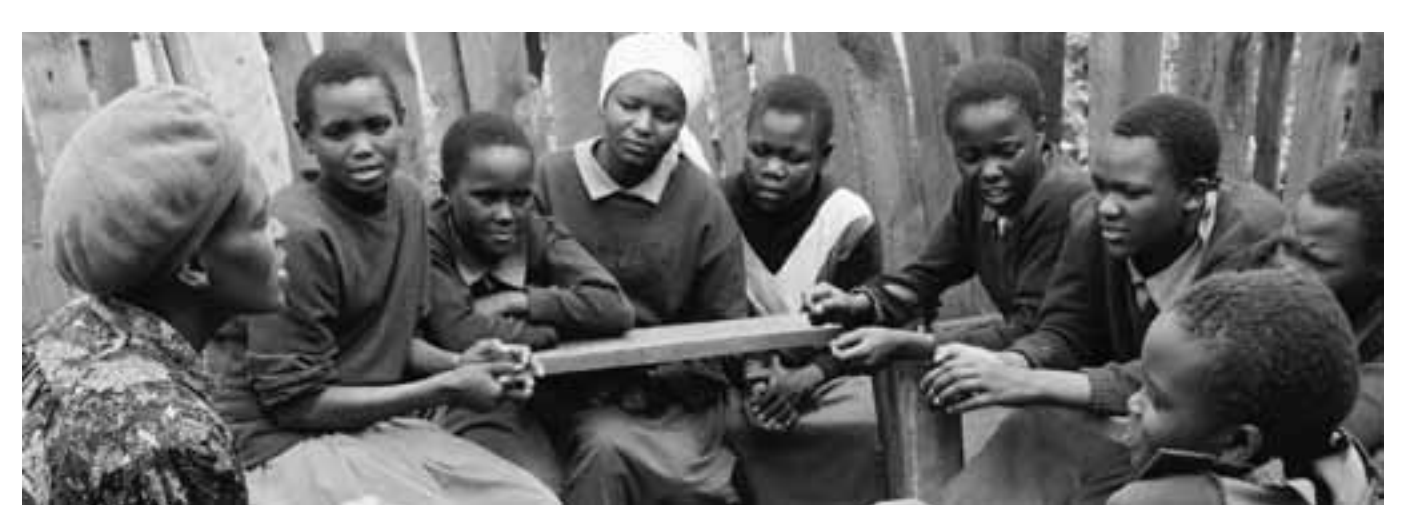
Young people taking part in memory work also need good information on sexual and reproductive health.