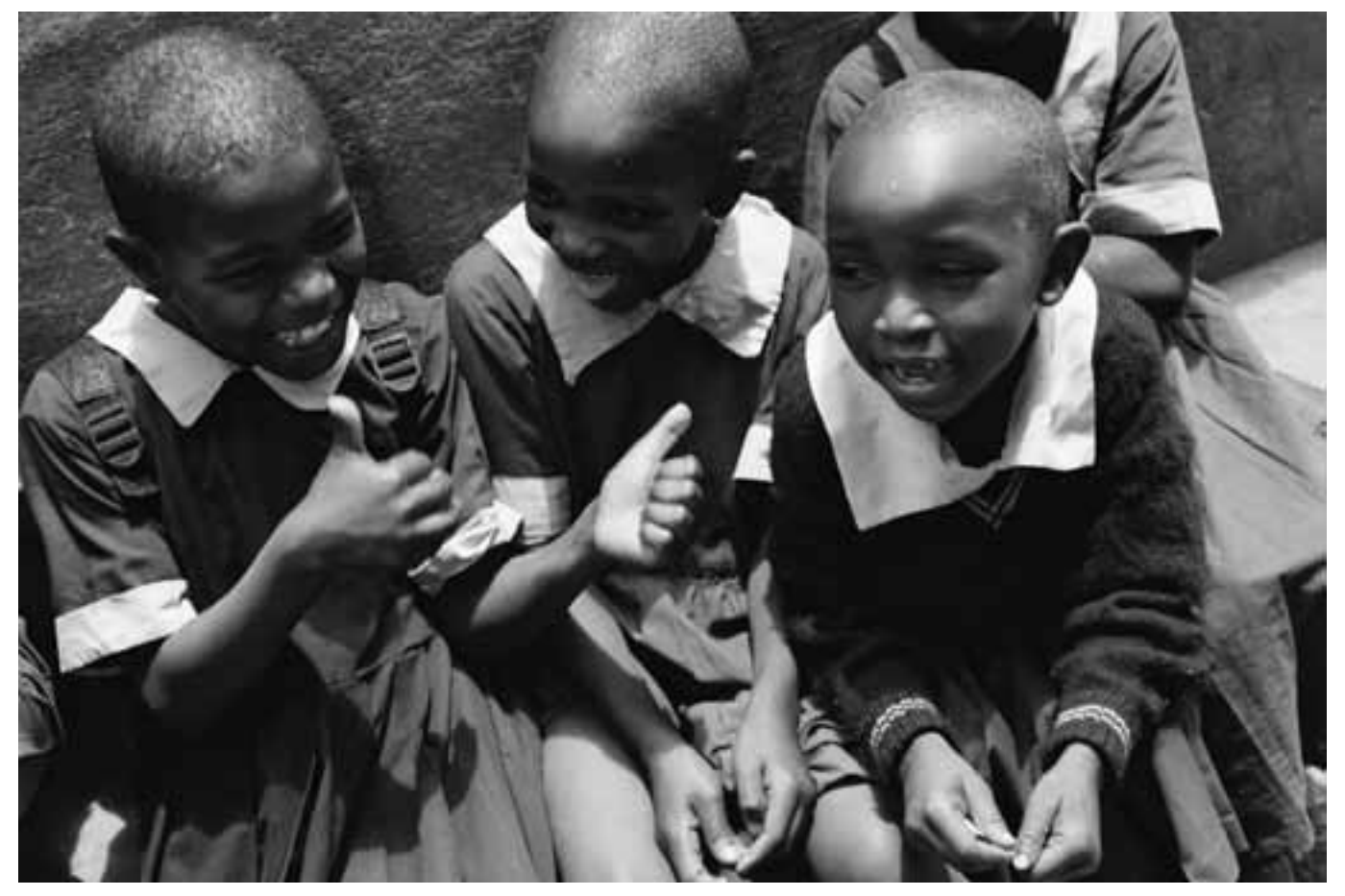
Involving children in memory work at an early age improves their resilience.

Since memory work was introduced as an approach within the HIV response, the availability of treatment has increased dramatically and has started to change the nature of the response to HIV and AIDS.