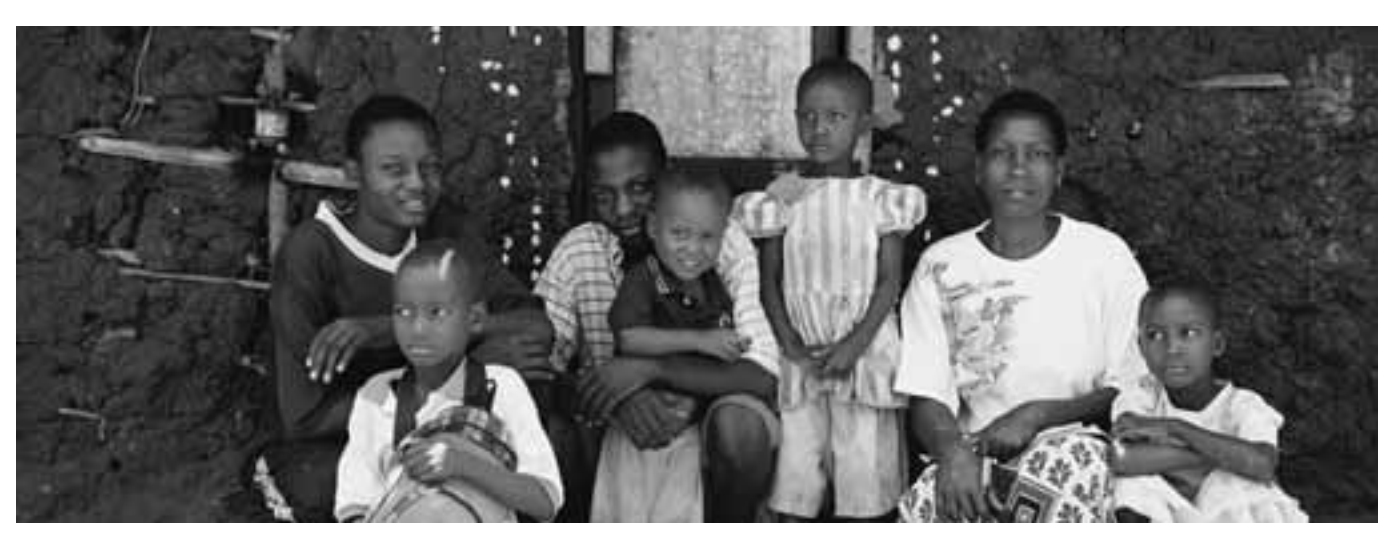
Memory work can help to strengthen the family.

Memory work will need to adapt and change as Zimbabwe responds to its changing situation and the increasing availability of treatment in the country. With the world's lowest average age life expectancy, the need for memory work in Zimbabwe's future is huge. FACT has built a strong basis for memory work, which can play an important role in helping Zimbabweans respond to the challenges of HIV in their country in the future.