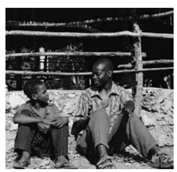
Memory work helps families talk about family matters.

Integrating memory work has shown that it can increase communication in the family, reduce stigma and encourage openness in all sections of society. So far, the most significant impact has been on the well-being of parents, and the partners hope that this will bear dividends in the future as the parent-child relationships continue to improve.