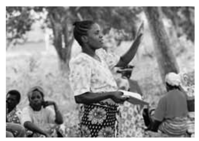
Sharing experiences through drama can help to reduce stigma and discrimination in the community.