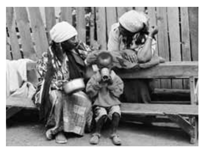
Regular visits to families in their homes are vital for many who do not have easy access to other methods of support.

The challenge for NACWOLA in the International Memory Project was to scale up their existing work to reach more of their members. From 2006 NACWOLA expanded memory work to five districts - Busia, Iganga, Luwero, Lira and Soroti. In these districts, new staff and volunteers were recruited and trained to implement memory work at community level. Now eleven other districts currently also include memory work in their activities. Most of NACWOLA's trainers are PLHIV, and there is a strong component of awareness-raising through drama and testimonies at community level. The memory book is used as a tool and a reference point to encourage parents to disclose their HIV status, fight stigma and discrimination and claim rights to health care, HIV treatment, and property. Staff encourage children through peer education techniques to reach out to their peers in school and in the neighbourhood.