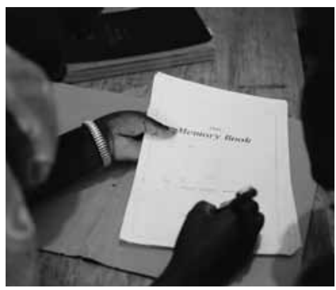
Writing a Memory Book encourages families to share knowledge and experiences for generations.

Support groups enable parents, guardians and children to explore issues in a supportive environment and receive support from other people who are experiencing similar situations. Children are also involved in activities which aim to: increase their knowledge of HIV and AIDS; develop and strengthen life skills; and develop peer support groups. Activities with children use child-centred approaches, which ensure that they are appropriate for the child's stage of development.