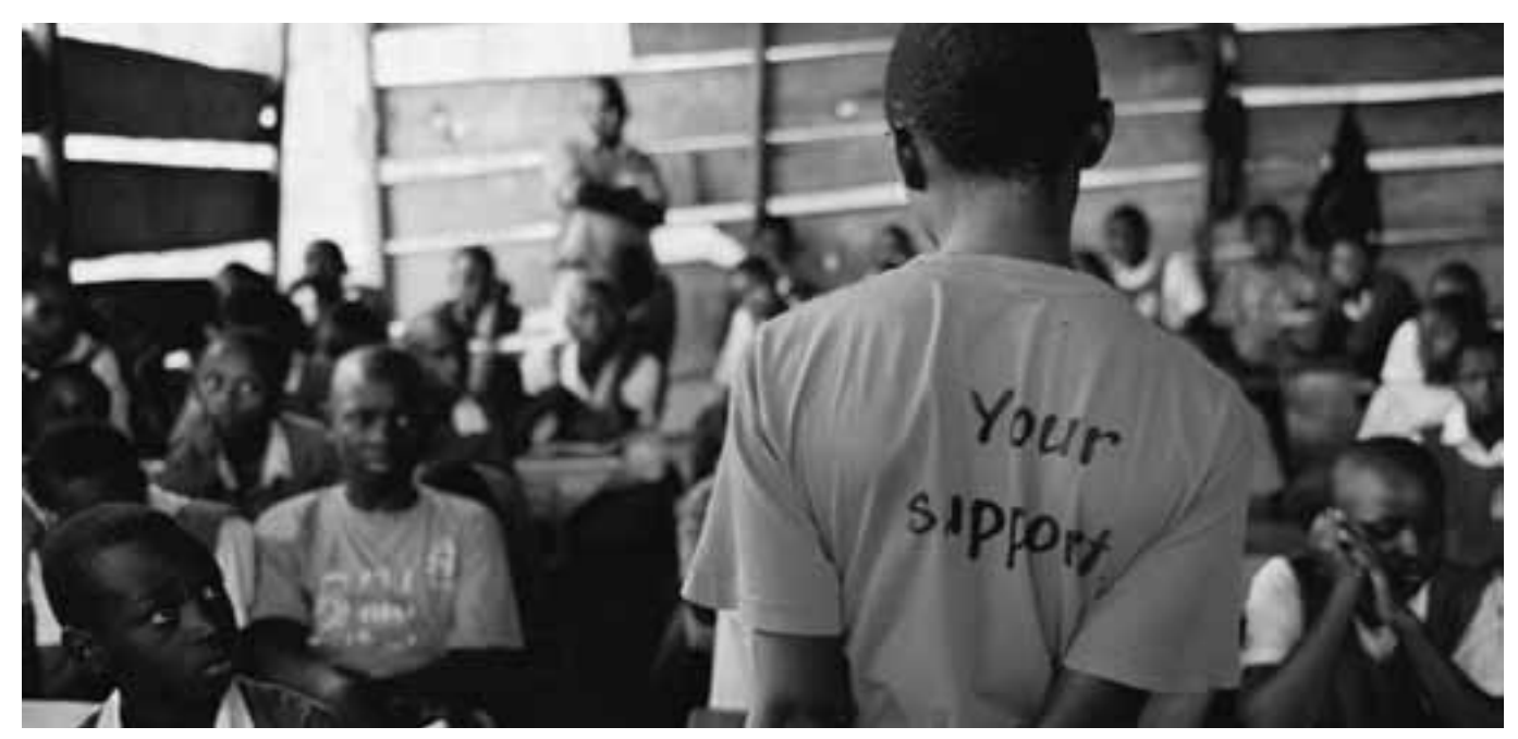
Memory work helps to strengthening activities for children and young people.

Traditionally in Tanzania, adults and children are encouraged to show strength when faced with bereavement and this makes many people reluctant to tell children any family information.