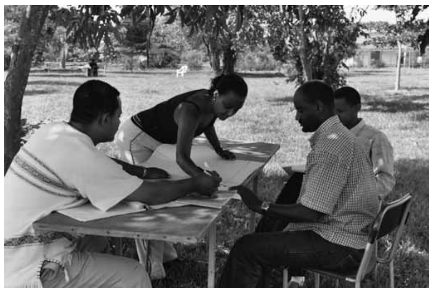
Healthlink supports partner organisations with memory work training.

Healthlink Worldwide had a central role in the International Memory Project from the beginning. Throughout the four year period, it has supported partners to develop programmes appropriate for their countries and locality. It also took the lead on fostering learning and interaction between all the partners.