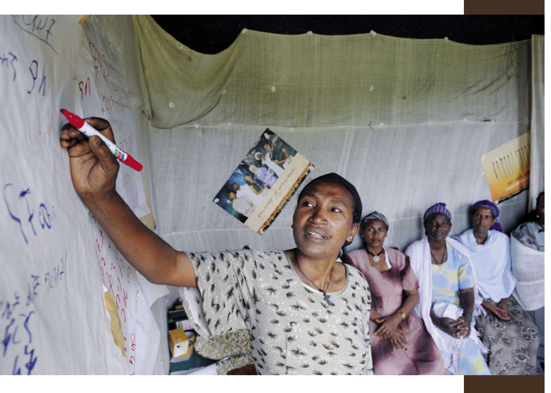
Impacts of internal mainstreaming, as experienced by local organisations and their staff